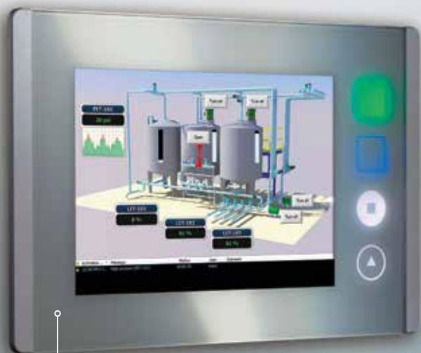
capacitive touch display by Hoffmann + Krippner