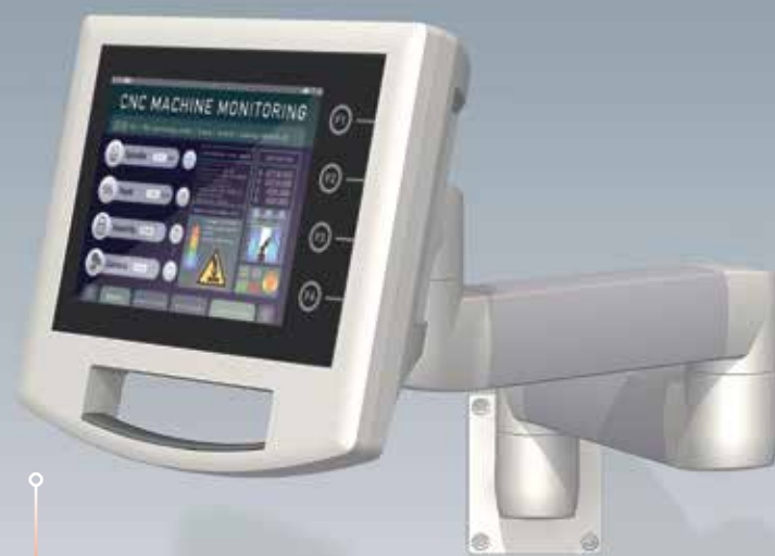
CARRYTEC – mounting on tripod / support arm systems possible, e.g. for machine control, medical technology, etc.