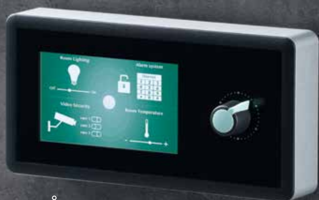
the individually configurable operating unit SYNERGY E200