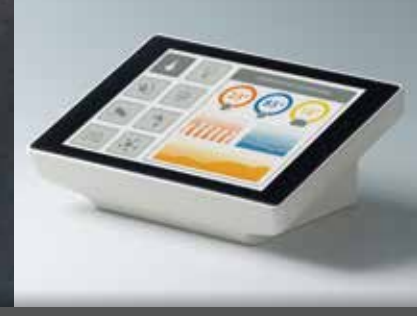
INTERFACE TERMINAL – ergonomically slanted operating surface by 20°